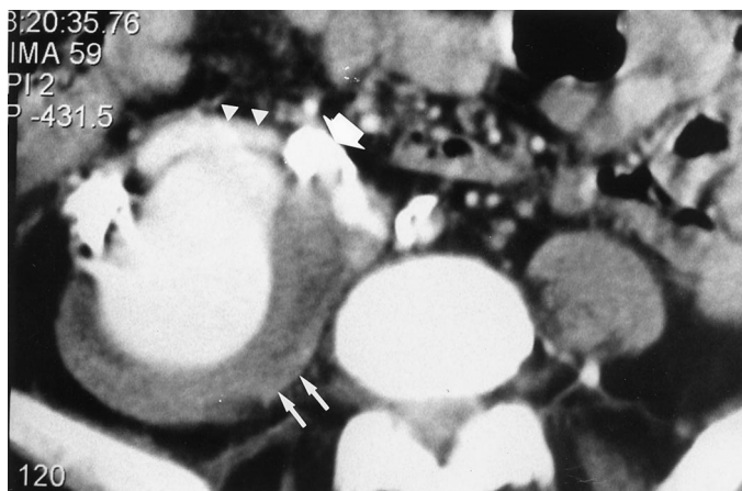
FIGURE 1. Contrast-enhanced CT scan of the pelvis shows a 7-cm pseudoaneurysm with enhancement of its lumen and nonenhancing wall of 1.5-cm thickness ( arrows ). The neck of the pseudoaneurysm ( arrowheads ) arises from the right common iliac artery ( large arrow ).

A total dose of 5000 U of thrombin had been required for complete occlusion of the pseudoaneurysm. The whole procedure lasted approximately 90 sec. A normal arterial pulse was confirmed in both the proximal and distal arteries. A color Doppler study performed the following day showed no