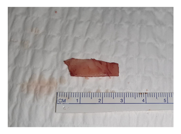
Fig. 3. The graft was 27 mm long and 7mm wide.

between the ULC and the LLC. The lateral third of the graft was placed in a pocket close to the pyriform sinus. Then, 4 simple sutures were place. The first suture (arrow A, Fig. 1) was fixed at the caudal edge of the lateral crura of the LLC to a point located between the middle third and the lateral third of the caudal edge of the graft. The second suture (arrow B, Fig. 1) was fixed at the caudal edge of the lateral crura of the LLC to a point located between the middle third and inner third of the caudal edge of the graft. The third suture (arrow C, Fig. 1) was used to fix the middle crura of the LLC to the top of the caudal edge of the graft. The fourth suture was fixed (arrow D, Fig. 1), and the overlapping area between the ULC and the LLC was fixed to the top of the crunial edge of the graft.